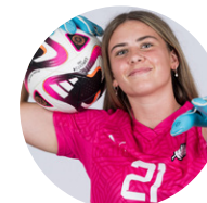
Taranaki Youth Boost Fund