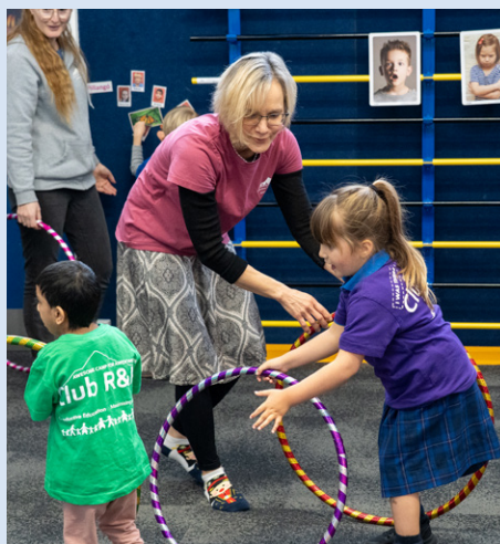
Above & Right: Conductive Education sessions in play!

Club R&R is all about families having fun together, creating lasting memories for children and whānau while supporting their growth in a nurturing, joyful setting.