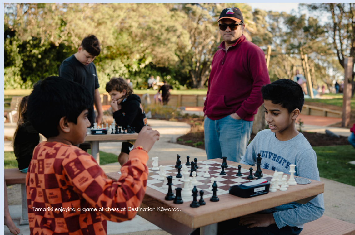
Tamariki enjoying a game of chess at Destination Kāwaroa.