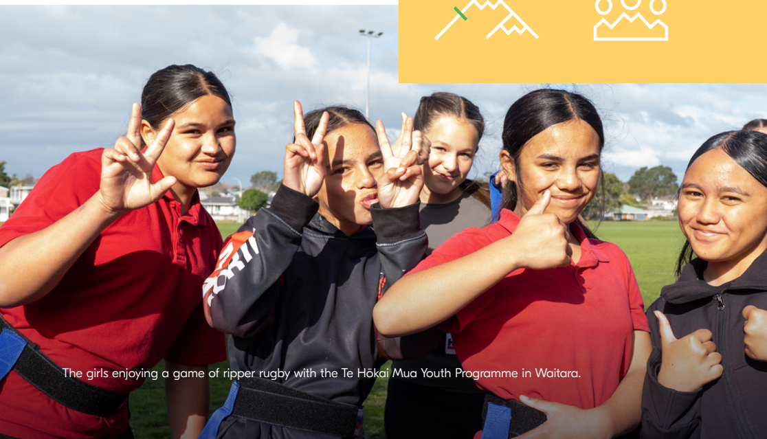
The girls enjoying a game of ripper rugby with the Te Hōkai Mua Youth Programme in Waitara.