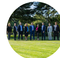
Connect Legal Taranaki Fund